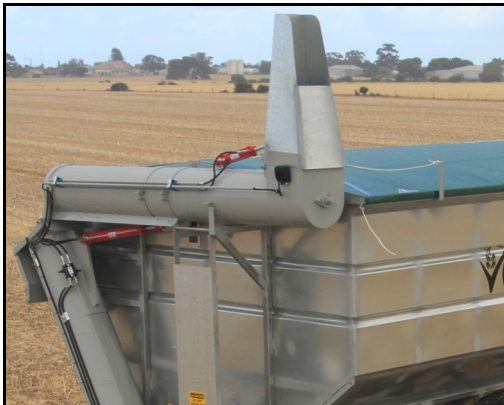
30 M³ Bin with auger folded fitted with standard hydraulic folding discharge chute