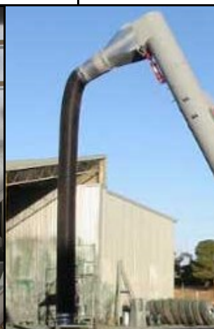
Optional Drop Spout Hose for filling Sheep Feeders etc