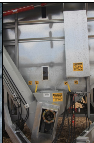
2 x shut off door indicators on front of bin