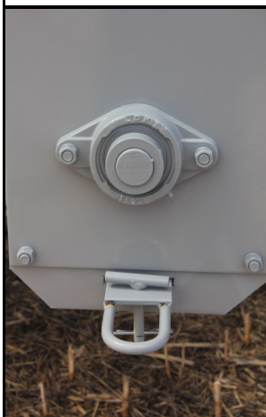
Full length removable cleanout floor bar