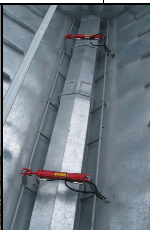
Hydraulic controlled shut off doors cover sweep flight