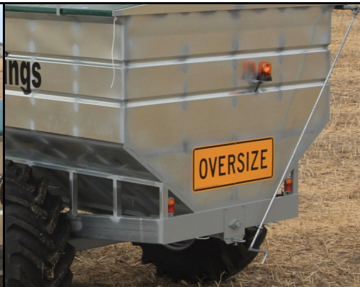
Bin fitted with LED Turning & Brake lights, Revolving Light and oversized sign