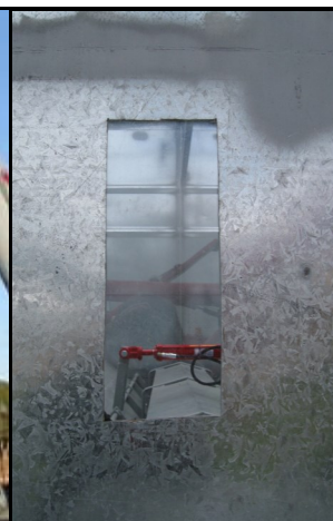
2 Large viewing windows in the front of the bin