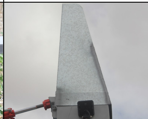
Hydraulic folding adjustable spout with 1200 lumen LED work light