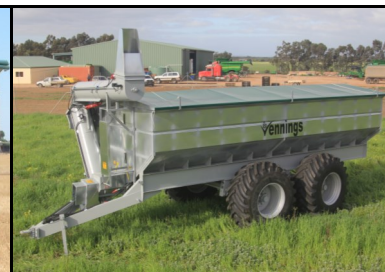
33 M³ Approximately 28 Ton Bin With Springs, Steering & Brakes