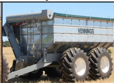
30 M³ Approximately 25 Ton Bin Rocker & Steering Axle