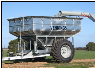
15 M³ Approximately 12 Ton Bin Fixed Axle