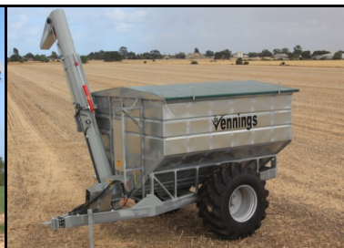
22.5 M³ Approximately 18 Ton Bin Fixed Axle