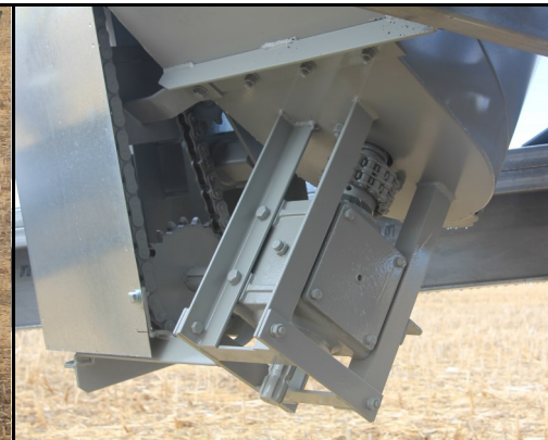
Heavy Duty Gearbox with 1" Drive Sprockets